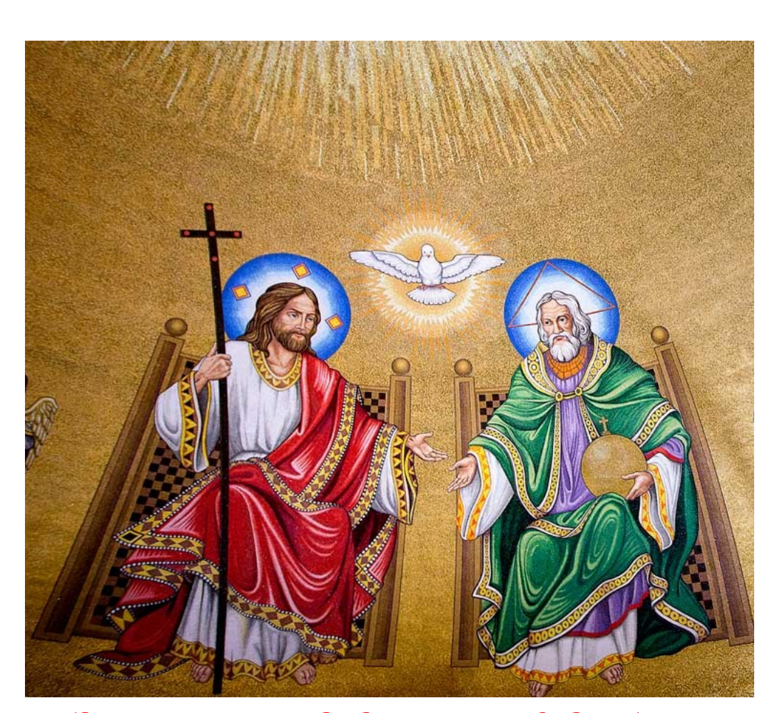
The Mystery of the Most Holy Trinity

June 5 5 pm June 13 6 pm June 19 5 pm June 27 6 pm